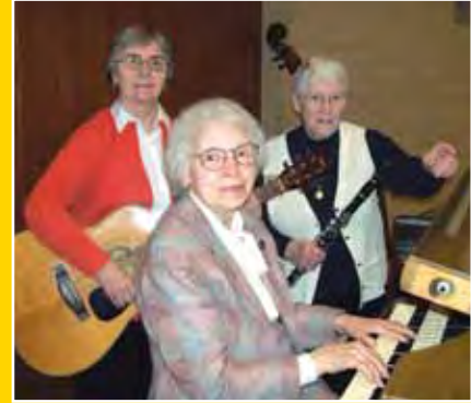
Sisters prepare for Christmas Liturgies.

Week after week we offer our gift of music at Sunday Eucharist. The upcoming celebration of Christmas will allow us to share the beauty and delight of music in a special way. We invite you to join us for our liturgy on Christmas Eve, at 8:30 p.m., and Christmas Day, at 9:30 a.m. Your voice will swell the angel choirs; your presence will enrich the Benedictine Sisters of Erie.